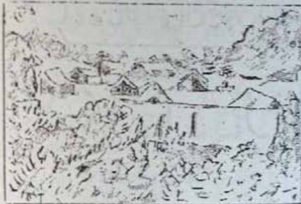
THE TENT CITY